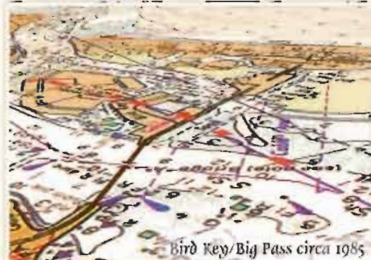
Bird Key/Big Pass circa 1985