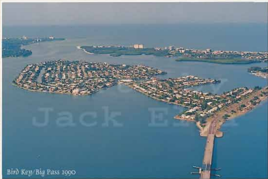
Bird Key/Big Pass 1990