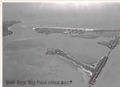
Bird Key/Big Pass circa 1927