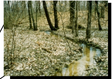
First-order streams are small.