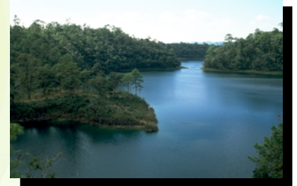
Fourth-order streams are large.

Streams are ordered according to their position in the watershed. The smallest streams have a "1" and are called "first-order" streams.