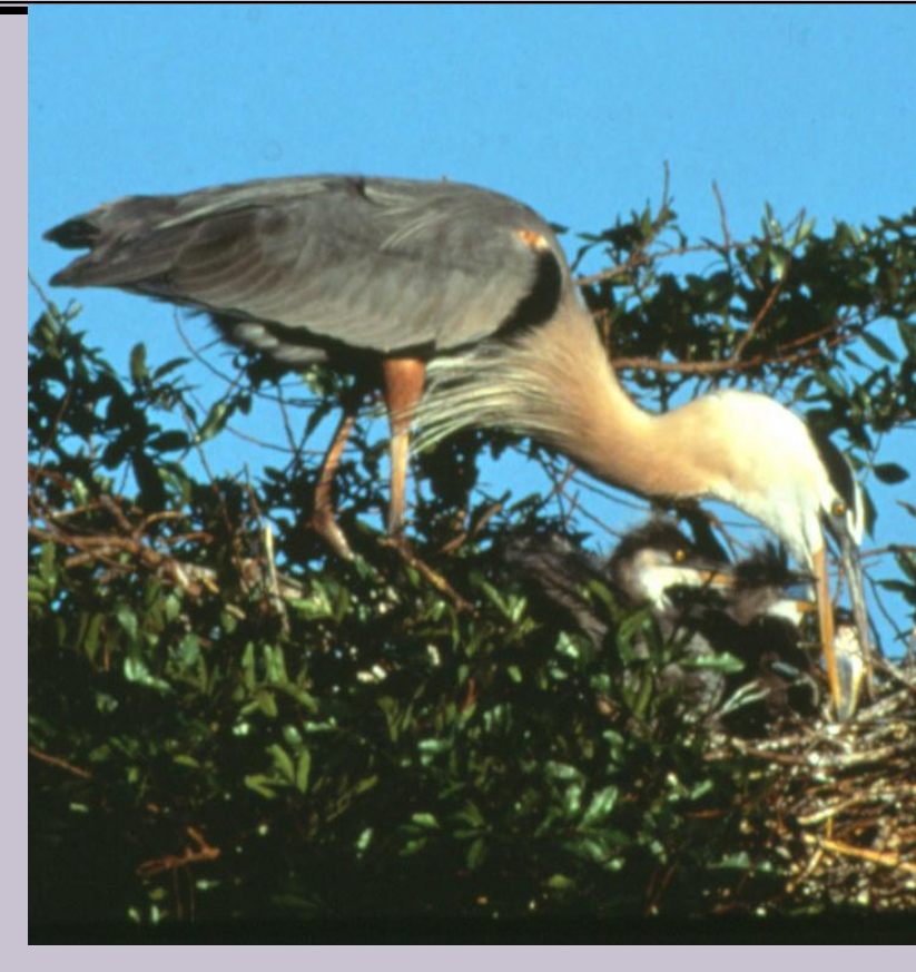
Great Blue Heron adult feeding chicks