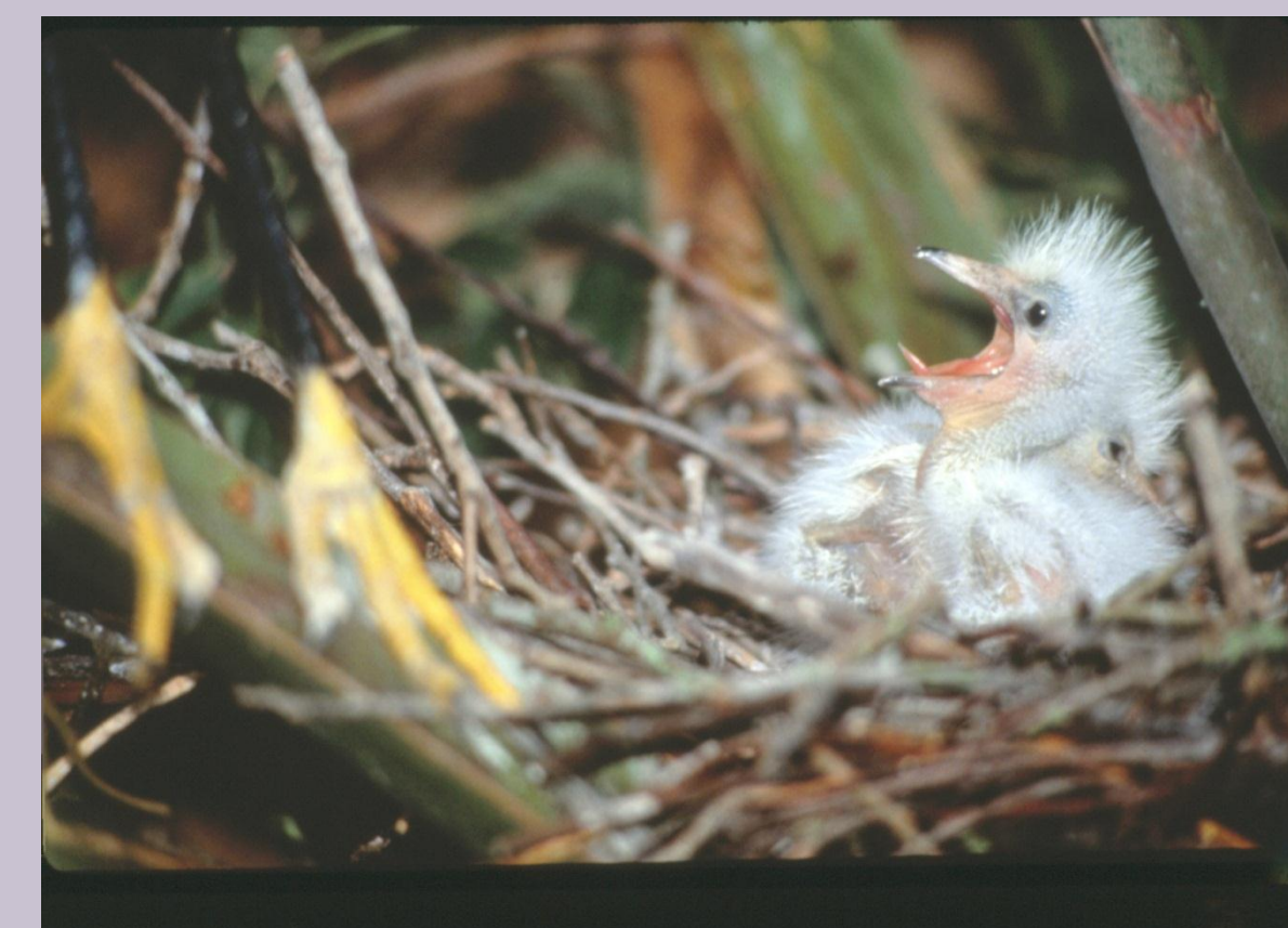
Snowy Egret chick begging