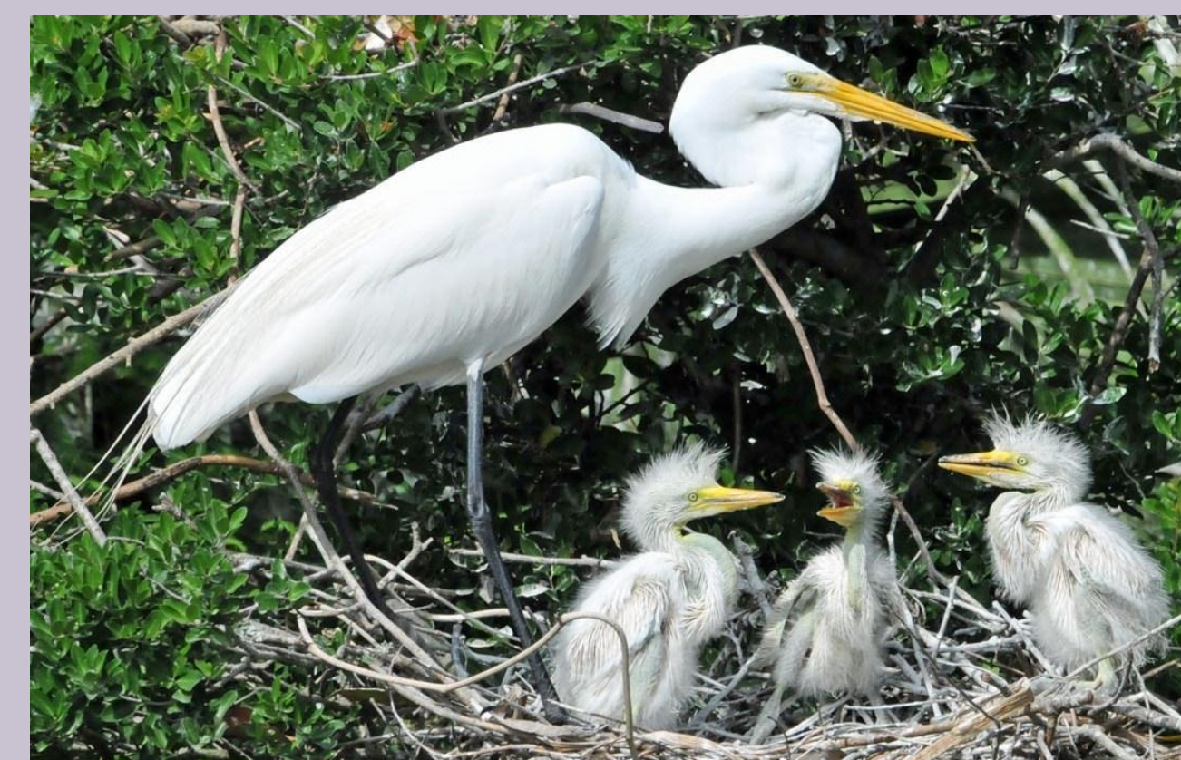
< Great Egret with chicks in the nest