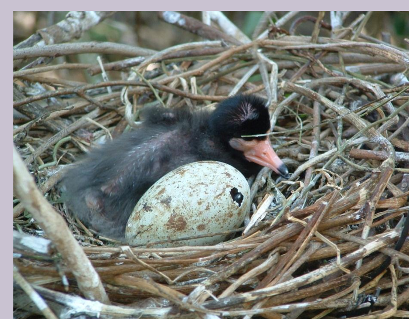
White Ibis chick & egg