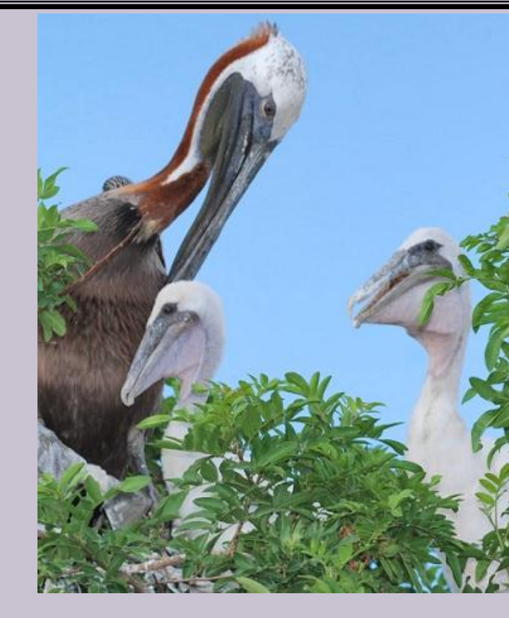
Brown Pelican with chicks in the nest