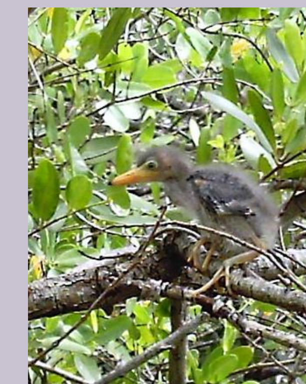
Green Heron “branchling”