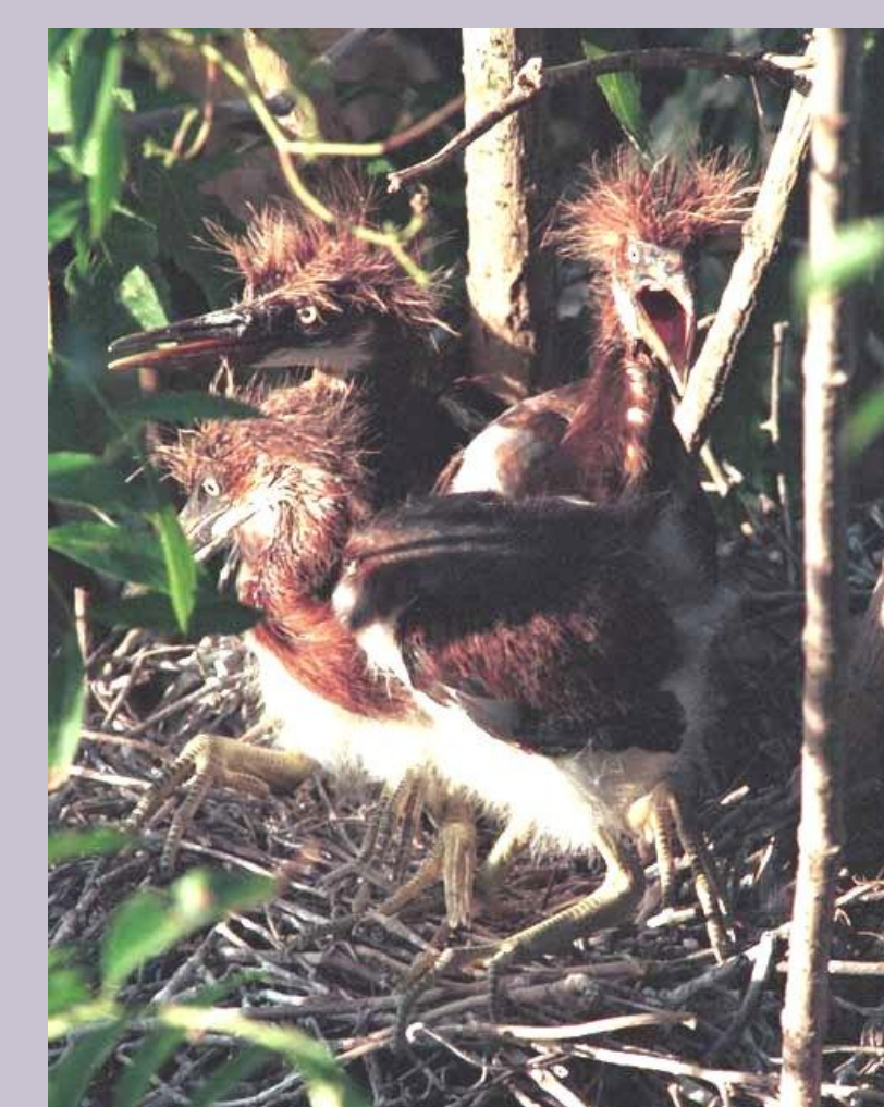
Tricolored Heron chicks