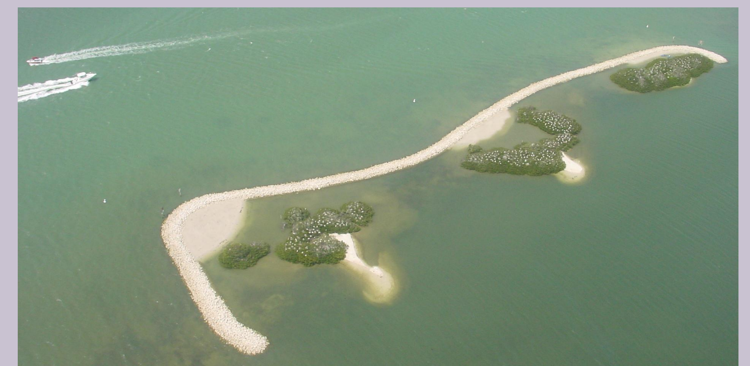
Sarasota County’s wavebreak to control erosion of the Roberts Bay Bird Islands (below)