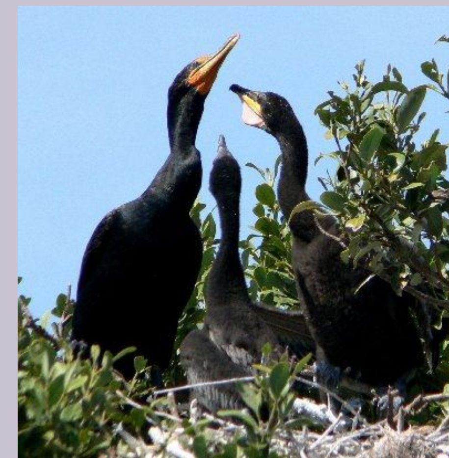
< Double-crested Cormorant adult (left) with chicks in the nest