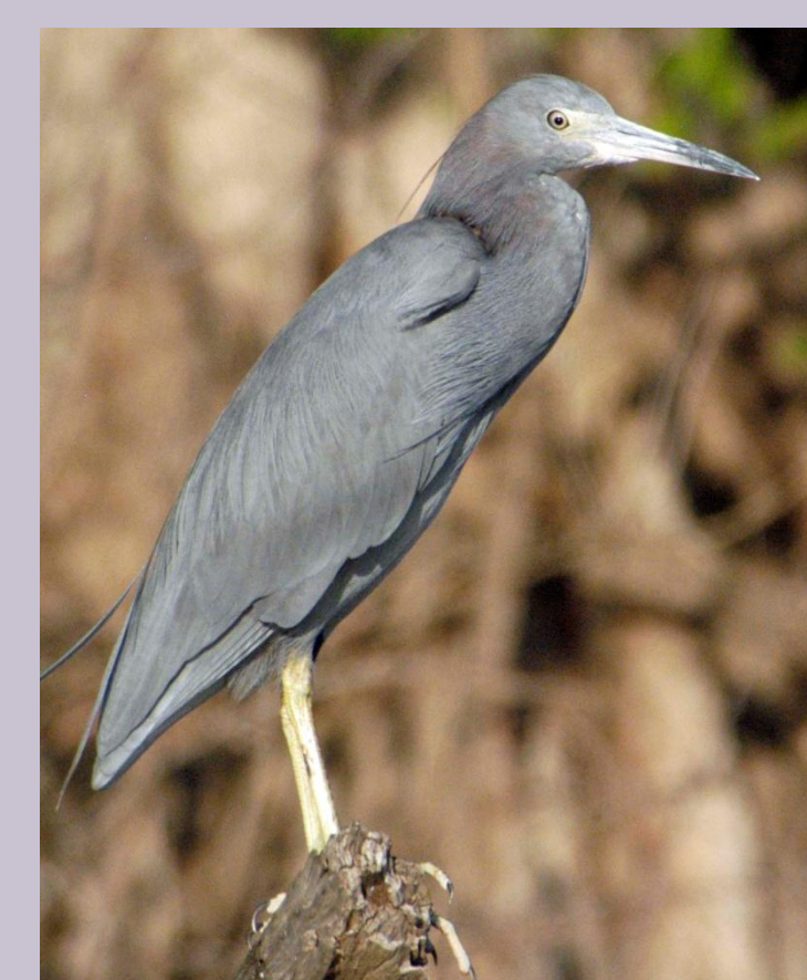
Little Blue Heron adult