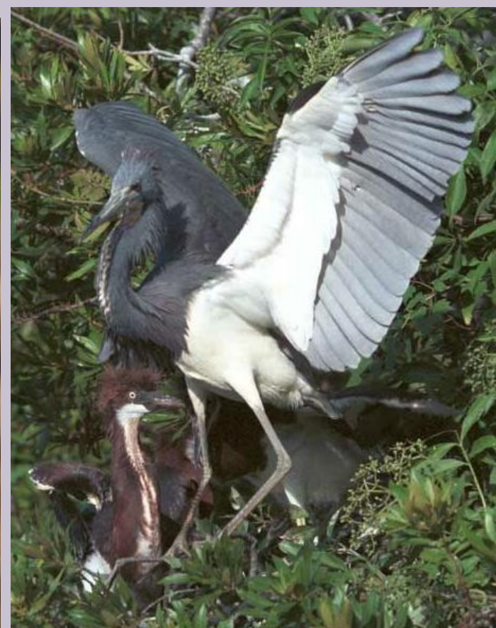
Tricolored Heron & chick