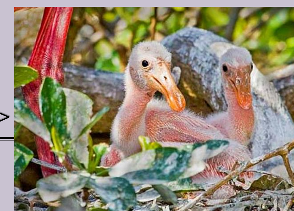
Two Roseate Spoonbill chicks >