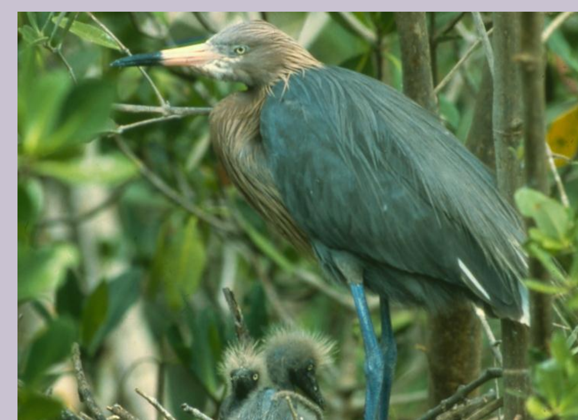
Reddish Egret with chicks