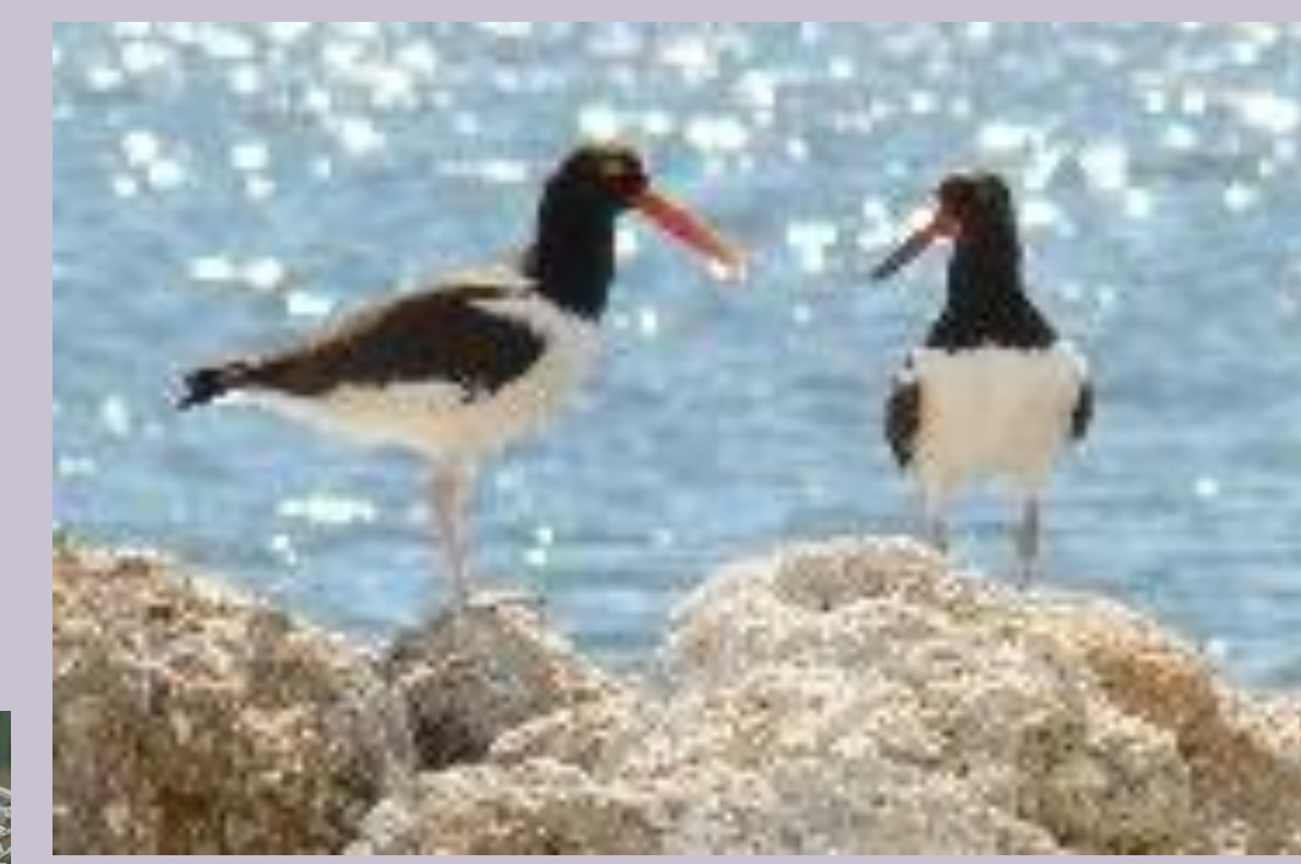
American Oystercatcher adult (left) with fledged chick, Roberts Bay Bird Islands