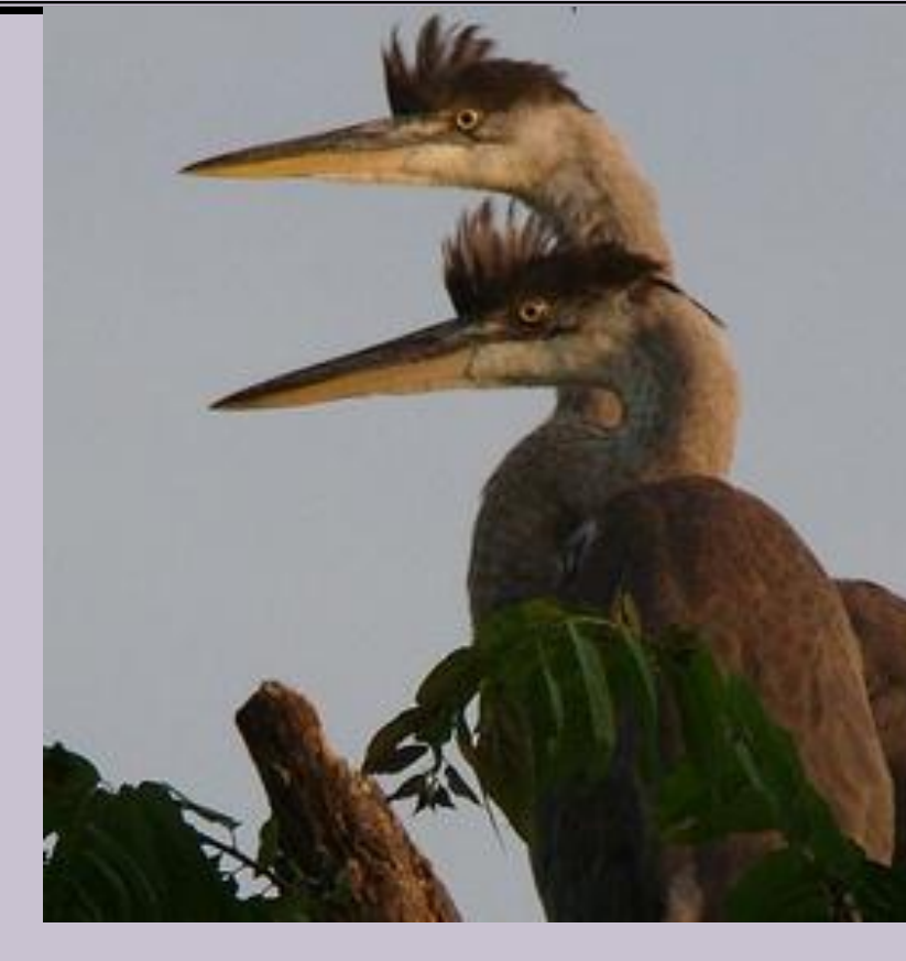
Great Blue Heron large chicks