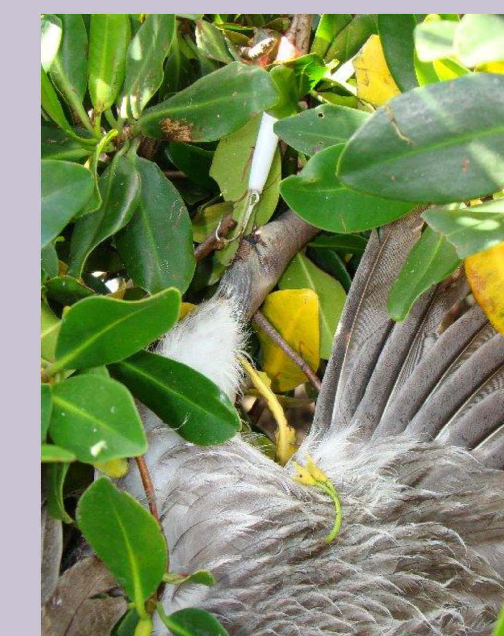
Brown Pelican killed by entrapment by fishing gear, Roberts Bay Bird Islands