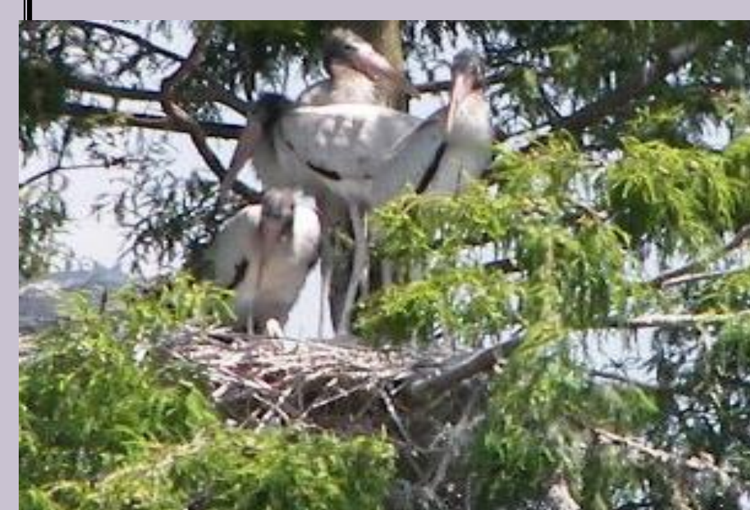
< Wood Stork chicks in the nest